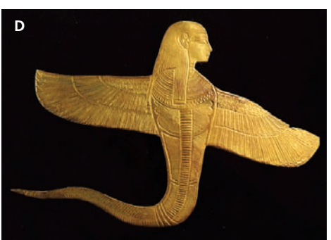
Gold double cobras, vulture, and winged uraeus (snake) with a woman's head RIGHT Papyrus amulet made of gold and feldspar