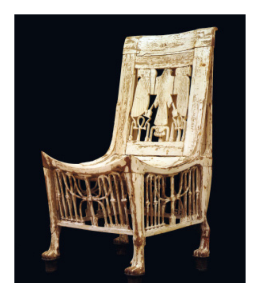
The sema tawy sign, seen here between the legs of the painted white wooden chair of King Tutankhamun DRAWING Sema tawy detail

Even though Upper and Lower Egypt were unified early in Egyptian history, the pharaohs always claimed that they ruled over "the two lands." A design element employed by the ancient Egyptians clearly illustrates this point. The sema tawy sign, seen here between the legs of the painted, white wooden chair of King Tutankhamun represented the unity of the two lands. The sema tawy depicts the two symbolic plants of Upper and Lower Egypt, the papyrus and the lily plant. The stems for these two plants intertwine around the hieroglyph for the human windpipe and lungs, which was the sign for "unite." As such, the decorations underneath the seat of the king's chair relayed the message that Upper and Lower Egypt were united under the king.