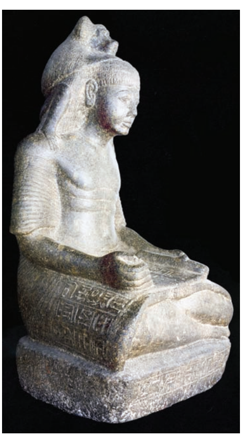
The scribe Ramessesnakht

riting was a special skill that few people in ancient Egypt possessed. Only one percent of the population could read and write. These people, known as scribes, included royalty and high officials of state and, below them, people for whom the ability to read and write was a necessary part of their job. Scribes were needed in every area of the country's administration—from the civil service, to the military, to the vast religious hierarchy.